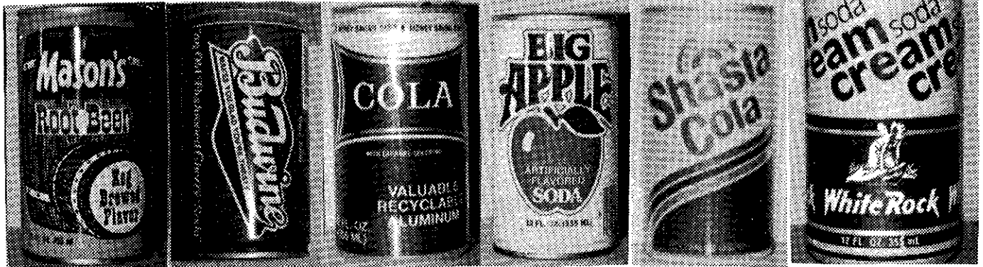
MONARCH COMPANY DORAVILLE GEO.