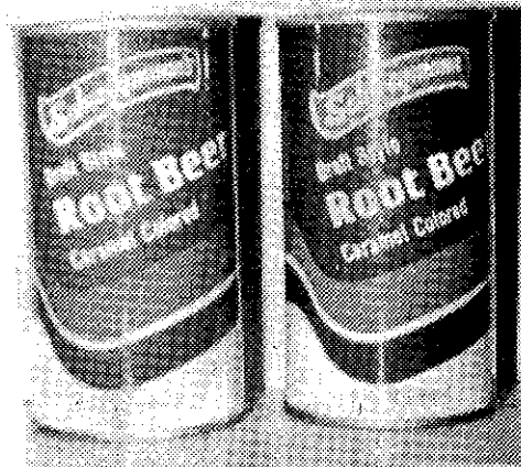
SCHWEGMANN'S SCHWEGMANN CANNED BY LASTARMO OF ABBEVILLE, LA.