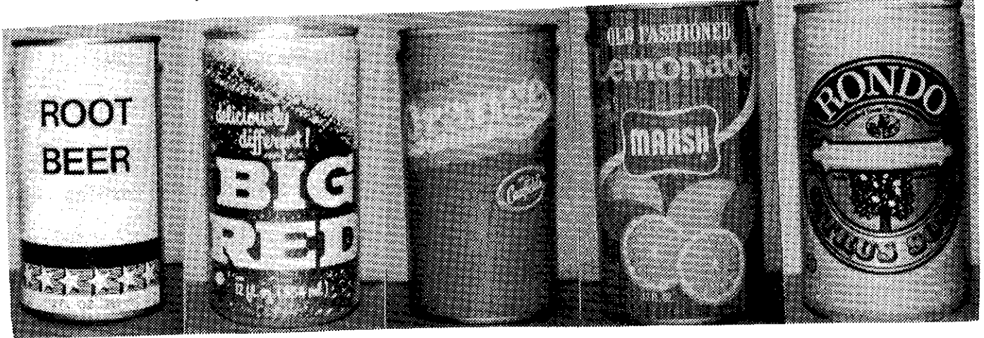
"GENERIC" FEDERATED FOODS ARLINGTON HTS ILL