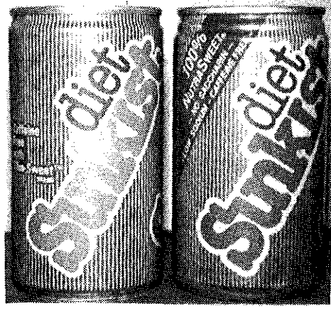
CHATANOOGA, TENN. LENEYA, KS