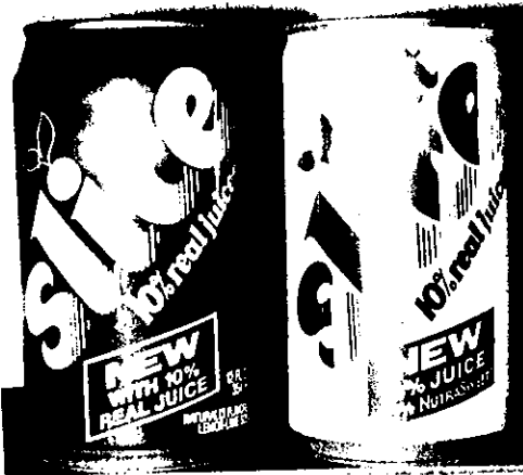
NEW SLICE NATIONAL RELEASE