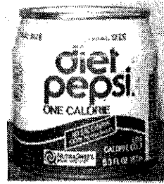
6.3 OZ DIET PEPSI "TRIAL SIZE" FROM WASHINGTON