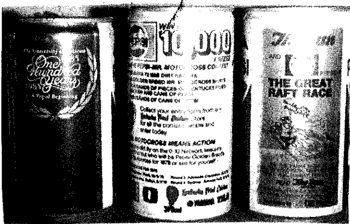
PEPSI'S UNIV. OF ARIZ