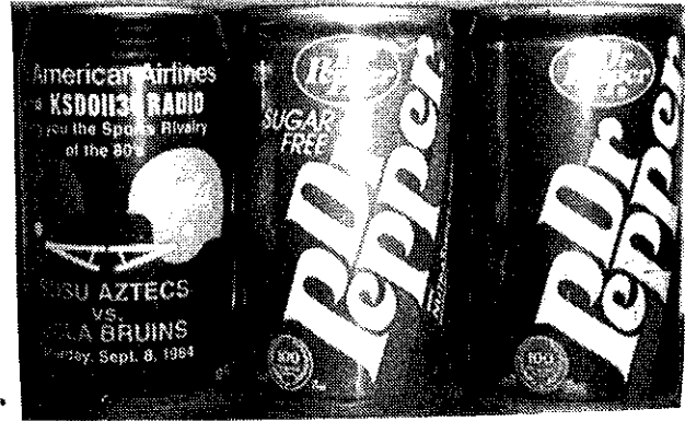
DR PEPPER'S SAN DIEGO AZTECS/BRUINS 100 YR LOGO - NATIONAL RELEASE