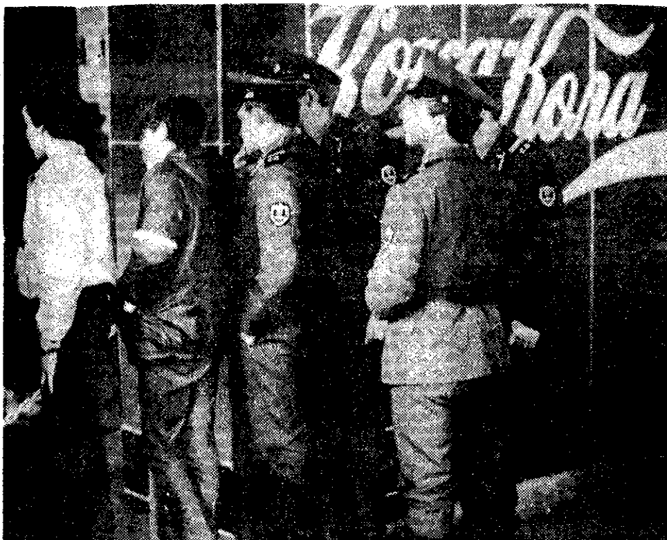
Coke is it for these Soviets who lined up to sample the cola at a trade fair. Coca-Cola will go on sale in the Soviet Union this summer.